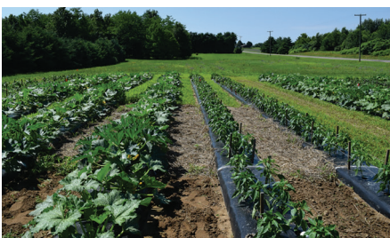
Figure 2. Between-bed management strategies including cultivation, straw mulch, and living mulch were evaluated in Michigan for impacts on summer squash and bell pepper production.

In one two-year experiment, we evaluated the system-level impacts of different between-bed management strategies on bell pepper and yellow summer squash produced on plastic mulch (Figure 2). We compared three between-bed living mulch treatments (cereal rye, Italian ryegrass and a rye-Dutch white clover mixture) to mowed ambient weeds, straw mulch and cultivated bare ground.