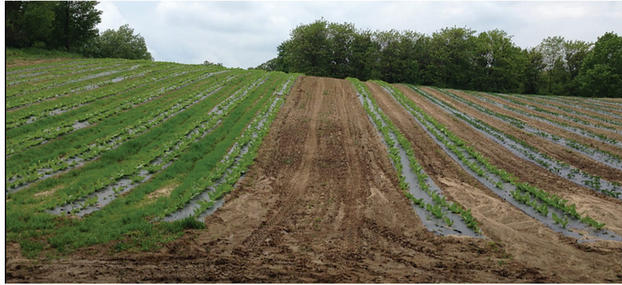
Figure 1. Cereal rye living mulch, left, reducing early season erosion when planted between plastic mulch beds on sloping ground at Forgotten Harvest Farms in Fenton, Michigan.

A second two-year experiment screened nine different cover crop species between plastic to evaluate growth, weed suppression and potential to compete with a cash crop for in-bed water and nutrients. The species included Italian ryegrass, teff, sudangrass, barley, cereal rye, winter wheat and three clover species grown in mixture with rye (Dutch and New Zealand white clover and yellow blossom sweet clover). In all experiments, living mulches were sown after bed formation and were mowed three-to-four times during the summer.