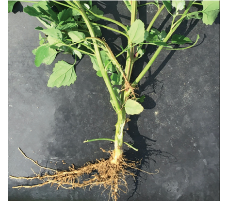
Figure 3: Weed (common lambsquarters) roots seeking water and nutrients under an adjacent plastic mulch covered bed.

Living mulch strategies should be matched to the needs of your unique production system. Growers interested in planting living mulch between plastic mulch beds should proceed with caution, acknowledging that living mulch systems entail new labor and management requirements in addition to potential risks to cash crop productivity. However, services not measured here, including